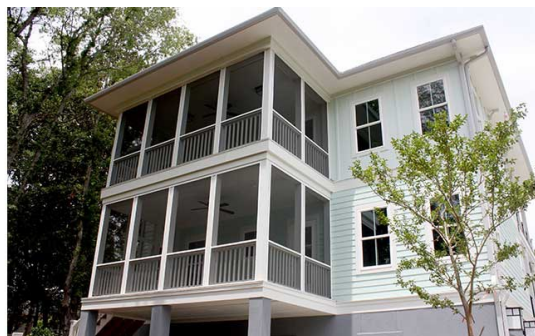
Stono Ferry Plantation - Two Family Home