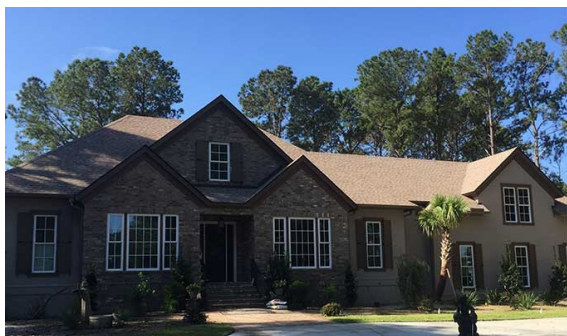
Stono Ferry Plantation