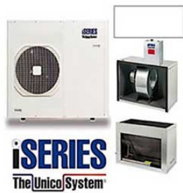
Heating & Air System