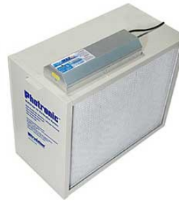
Microscopic Particle Filtration