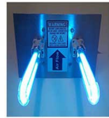
UV Bacteria Purification