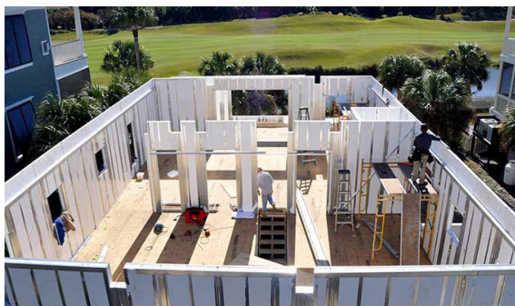
Isle of Palms